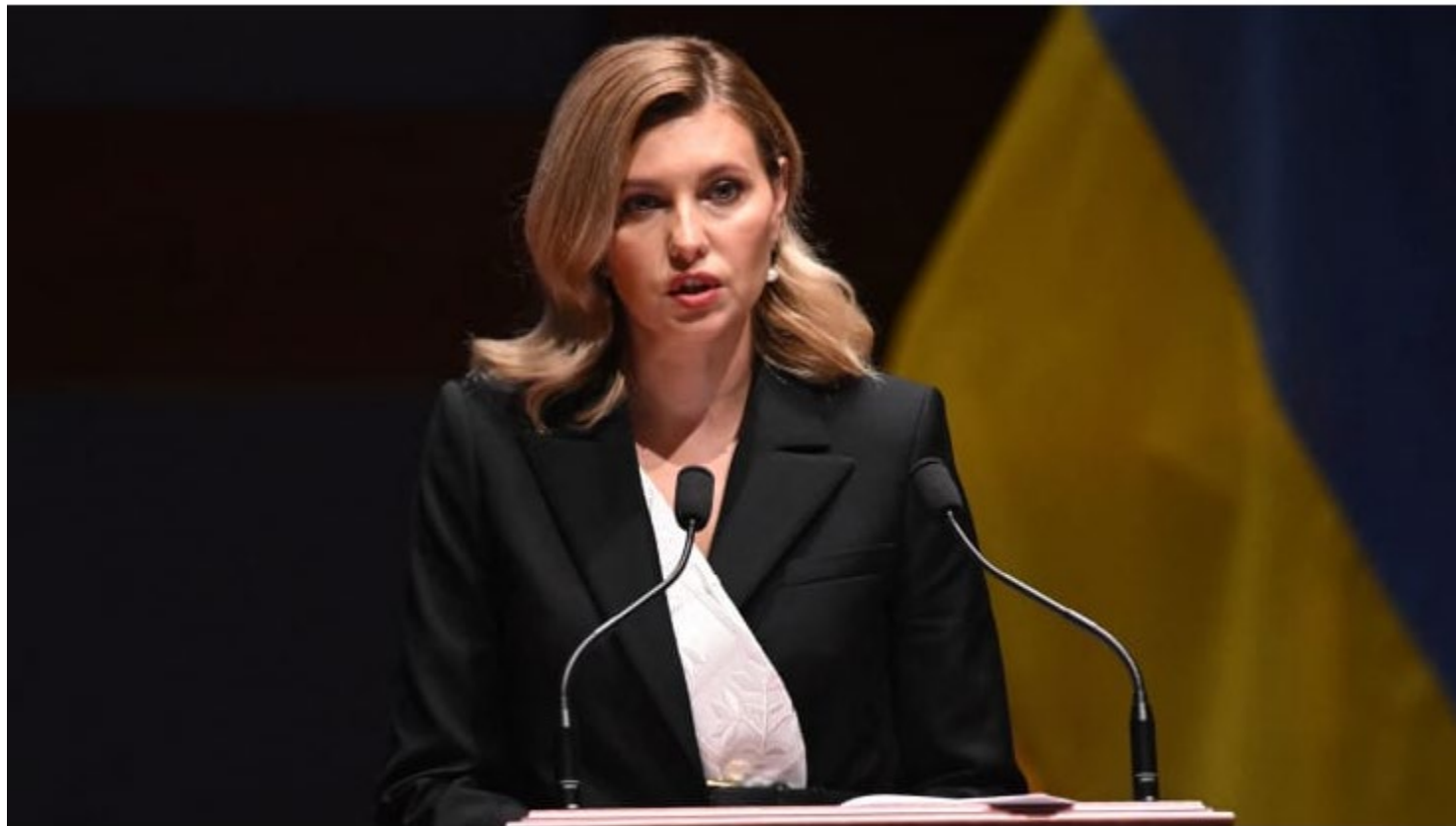
Ukrainian First Lady Olena Zelenska speaks to members of the US Congress about Russia's invasion of Ukraine, in the US Capitol Visitors Center Auditorium on July 20, 2022, in Washington, DC.